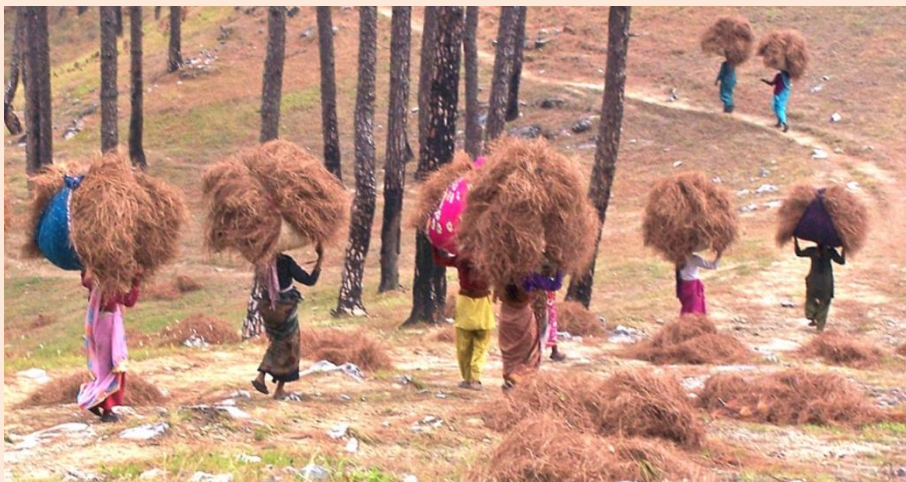
Locals collecting pine needles on the ground.

“The centre has set up its own briquette and pellet production plant on the IIT-Mandi campus. The Government of Himachal Pradesh has announced a subsidy of 50 % up to 25 lakhs for one unit on capital expense for a pine needle-based plant. This assistance can be obtained by giving a letter [to] the office of the Regional Forest Officer,” she added.